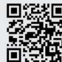
EXHIBIT AT WEST AFRICA'S BIGGEST MEDICAL EXPO!