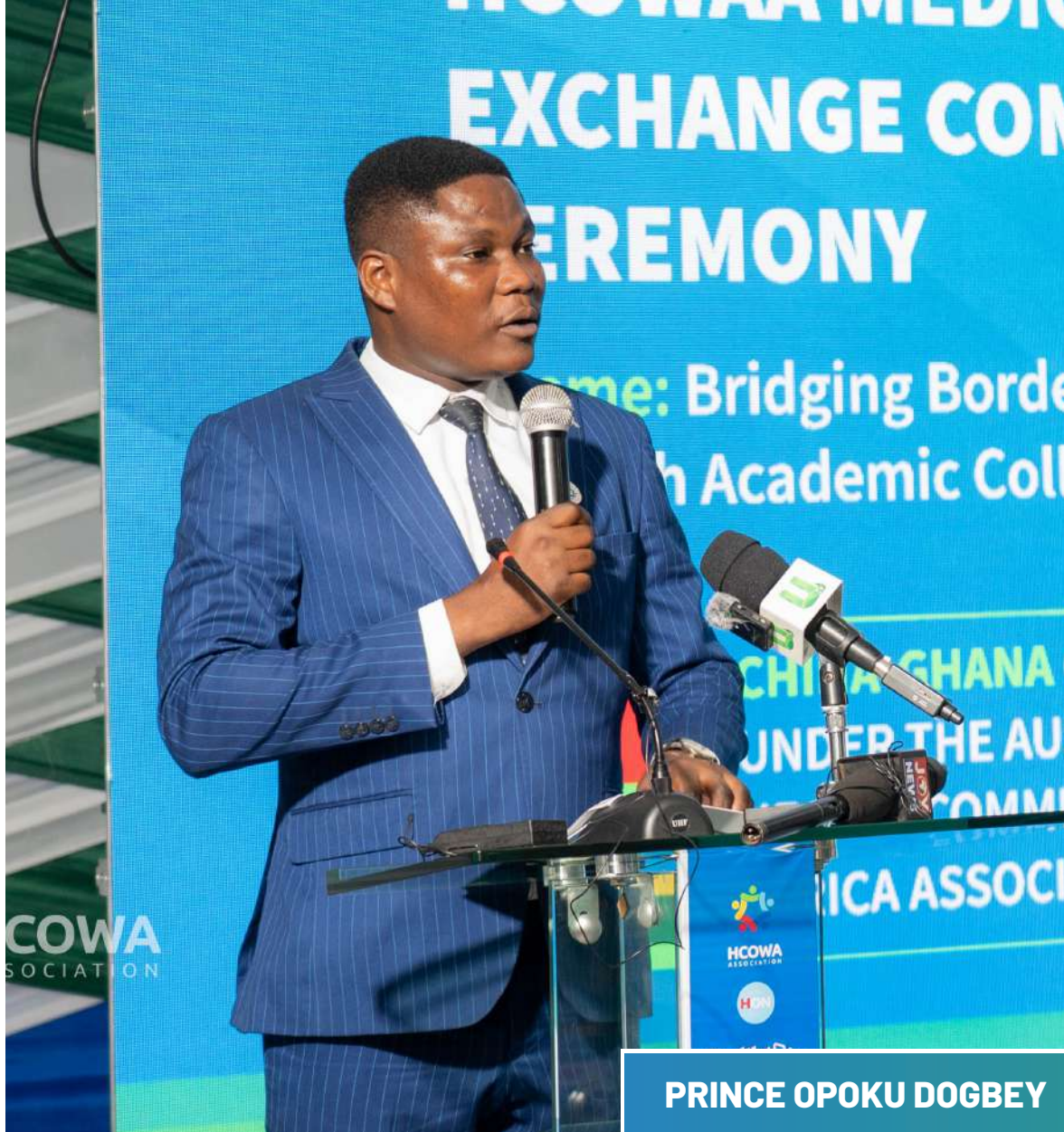
PRINCE OPOKU DOGBEY